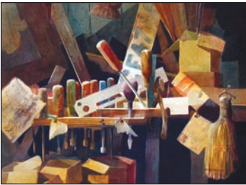
“COMPOSITION FOR IMPACT” (WC) All Levels Thurs., June 23, 9am–5pm Jefferson, $160 WKSHP-BRS76

This class will show you how to set up any subject in an impactful way to stimulate your viewer to be drawn into the workings of the painting. It will be a concentrated class reduced from three days into one. Whether you paint reality, abstract, or non-objectively, this essential knowledge will help you raise the appeal of your paintings. Four hours of intense lecture, discussion, quick demos and lots of visual stimuli will set up for three hours of applying the ideas to a simple subject. FREE Kilimanjaro paper will be provided by Cheap Joe's , and a black value marker, compliments of Prisma-color . www.mebaileyart.com