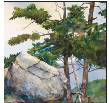
“NO BOUNDARIES! WATERCOLOR AND MIXED MEDIA” (WC/MIX) Intermediate–Advanced* Sat., June 25, 9am–5pm Northwestern, $160 WKSHP-BRS83

Achieving correct/desired value patterns with watercolor is a challenge for many artists. We are often so enamored with the “color opportunities” of this medium that the importance of getting values right is often pushed aside until we view the end results! Gaining a better understanding of how watercolor pigments result in certain value ranges is guaranteed to improve your results. A one hour discussion and demonstration will be followed by a painting lab with assistance. *Some experience with watercolor is helpful, but not required. FREE Kilimanjaro paper and a tube of American Journey “Prussian Blue/Green Shade” will be provided by Cheap Joe's . www.beartrailstudio.com