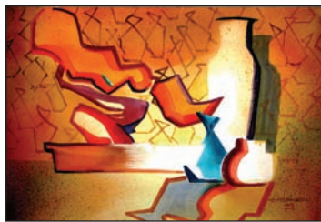
“EXALT THE MUNDANE TO EXTRAORDINARY” (WC) All Levels Sat., June 25, 9am–5pm Jefferson, $160 WKSHP-BRS79

This workshop will be to help painters build unity and harmony into their paintings and set up the context in which to judge their work. The idea of dominance in a piece applies to every type of art, photo realistic or non objective. A painting can be quite chaotic if this simple idea is not carefully put to task. Building a repertoire of ideas to set dominance will come from lecture, class discussion, and critiques of paintings provided by the instructor. This class is essential for anyone interested in taking their art to a higher level of design and to gain acceptance into shows. This class will awaken the novice or the advanced painter to new ideas for otherwise mundane paintings. A writing pen (compliments of Cheap Joe's ) and a sketch pad (compliments of Strathmore ) will be provided. www.mebaileyart.com