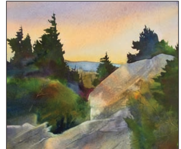
“WC VALUES—GETTING THEM RIGHT THE 1ST TIME” (WC) All Levels* Fri., June 24, 2pm–6pm Northwestern, $95 WKSHP-BRS82

This workshop will focus on helping you learn how to overcome two common barriers in creating successful watercolor paintings. 1: using your pigments properly and in adequate concentrations, and 2: learning the “physics” of how to control your washes and greatly improve results. The first hour will be a discussion and demonstration, followed by a painting lab with instructional assistance. *Some experience with watercolor is helpful, but not required. Cheap Joe's will provide FREE Kilimanjaro paper and a tube of “Joe's Blue” American Journey paint. www.beartrailstudio.com