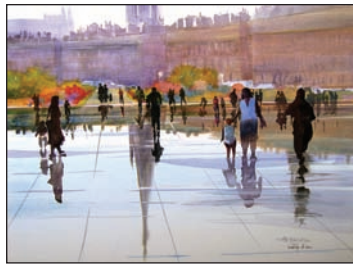
“APPLYING DOMINANCE” (WC) All Levels Fri., June 24, 2pm–6pm Jefferson, $95 WKSHP-BRS78

The seven elements of design are not only the basis of good designs, but are also the starting points for truly creative paintings. Arm yourself with the power to make realistic paintings come alive or to make abstractions dazzle the viewer. This short, four hour class will be to bring forth different ways to use and exploit the 7 elements of design. We will hold two fast hours of animated lecture and demonstration followed by two hours of absolute play with hands on exercises. FREE Kilimanjaro paper and a #7 Golden Fleece Round Brush will be provided by Cheap Joe's . www.mebaileyart.com