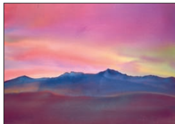
“PAINTING BOLD AND CONTROLLED WITH WATERCOLOR” (WC) All Levels* Fri., June 24, 9am–1pm Northwestern, $95 WKSHP-BRS81

This workshop will provide a complete overview of painting a watercolor landscape using the wet-into-wet technique. Topics include pigments and materials, controlling and layering washes, building body color in land masses, modeling and forming shapes, under-painting for atmosphere, and finishing and detailing on dry paper. This workshop will be structured in two phases, with a demo and painting lab associated with each phase. Bring your own landscape image(s) or you may choose from images provided. *Some experience with watercolor is helpful, but not required. Kilimanjaro paper will be provided, compliments of Cheap Joe's , along with a watercolor brush donated by Winsor & Newton . www.beartrailstudio.com