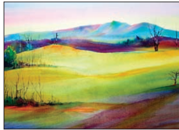
“A BEAUTIFUL WET DAY” (WC) All Levels* Thurs., June 23, 9am–5pm Northwestern, $160 WKSHP-BRS80

This workshop will provide a complete overview of painting a watercolor landscape using the wet-into-wet technique. Topics include pigments and materials, controlling and layering washes, building body color in land masses, modeling and forming shapes, under-painting for atmosphere, and finishing and detailing on dry paper. This workshop will be structured in two phases, with a demo and painting lab associated with each phase. Bring your own landscape image(s) or you may choose from images provided. *Some experience with watercolor is helpful, but not required. Kilimanjaro paper will be provided, compliments of Cheap Joe's , along with a watercolor brush donated by Winsor & Newton . www.beartrailstudio.com