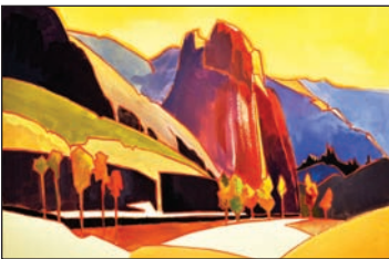
“SEVEN IDEAS TO CREATIVITY” (WC) All Levels Fri., June 24, 9am–1pm Jefferson, $95 WKSHP-BRS77

This class will show you how to set up any subject in an impactful way to stimulate your viewer to be drawn into the workings of the painting. It will be a concentrated class reduced from three days into one. Whether you paint reality, abstract, or non-objectively, this essential knowledge will help you raise the appeal of your paintings. Four hours of intense lecture, discussion, quick demos and lots of visual stimuli will set up for three hours of applying the ideas to a simple subject. FREE Kilimanjaro paper will be provided by Cheap Joe's , and a black value marker, compliments of Prisma-color . www.mebaileyart.com